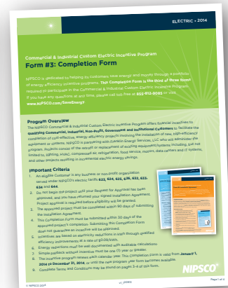
Form #3: Completion Form

Customer completes and signs the Request for Approval form, then sends to the NIPSCO Incentive Programs Processing Center (see contact information below).