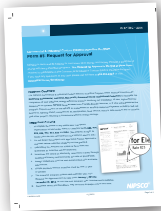
Form #1: Request for Approval

To help you take full advantage of the NIPSCO Commercial & Industrial Custom Electric Incentive Program, please read the necessary steps below to achieve both energy savings and program incentives for your business.