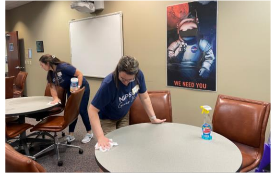
NIPSCO employees clean and organize the Challenger Learning Center of Northwest Indiana.