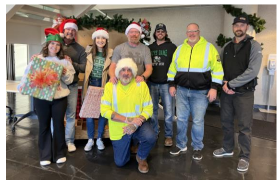
NIPSCO volunteers gather to distribute 1,000 donated toys to Toys for Tots.

"It is wonderful for us to go out in the community and support these deserving organizations. Our NIPSCO team finds it so rewarding to work with these organizations, and we are committed to making a positive impact in northern Indiana."