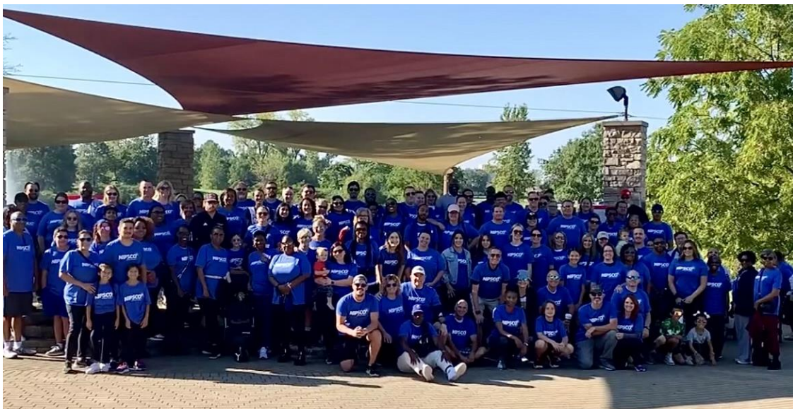
NIPSCO employees supported the American Heart Association's 2023 Heart Walk in Lake County.

NIPSCO Director of Public Affairs and Economic Development