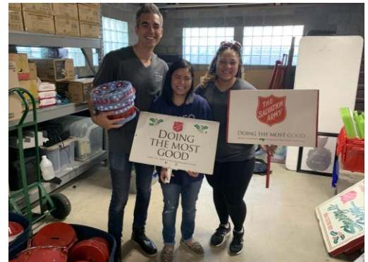
NIPSCO employees re-painted the Salvation Army's red kettles that are used during the holiday season.