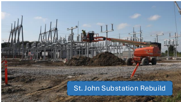
St. John Substation Rebuild

Over $30 million was invested to enhance the St. John Transmission Substation in Schererville, Ind. This project included the construction of a new 138-69 kV yard which will facilitate the addition of two new 69 kV circuits extending both north and east, as well as south and west. Additionally, resources were allocated to rebuild and upgrade two existing 69 kV lines. This involved installing approximately six miles of new transmission wire and 132 steel poles. This initiative not only supports economic growth but also enhances system reliability and safety by integrating the latest technological advancements to bolster the overall electric infrastructure. This multi-year project that began in early 2024 was recently completed.