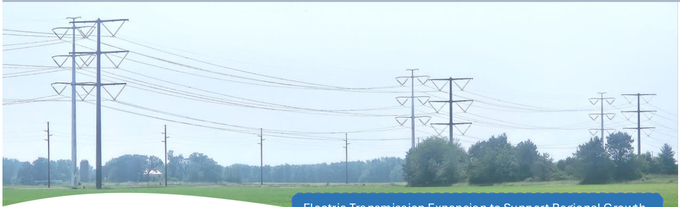
Electric Transmission Expansion to Support Regional Growth St. John, Schererville, Merrillville and Crown Point