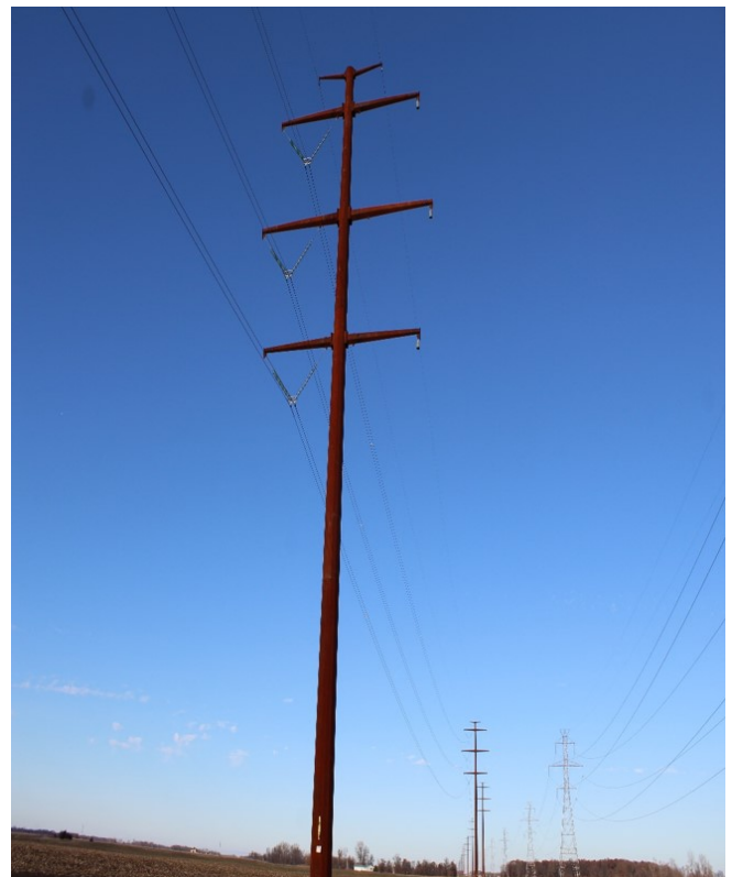
Example picture of new steel monopole towers to be installed in your area.